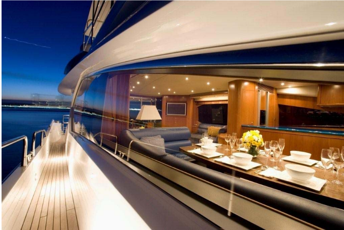
Side passage way looking into the lounge/dining room

Australian Charter Services PO Box 57, Berowra Heights NSW 2082 Tel: 0412 441 399 | Fax: 02 9456 4837 email: info@australiancharters.com.au www.australiancharters.com.au