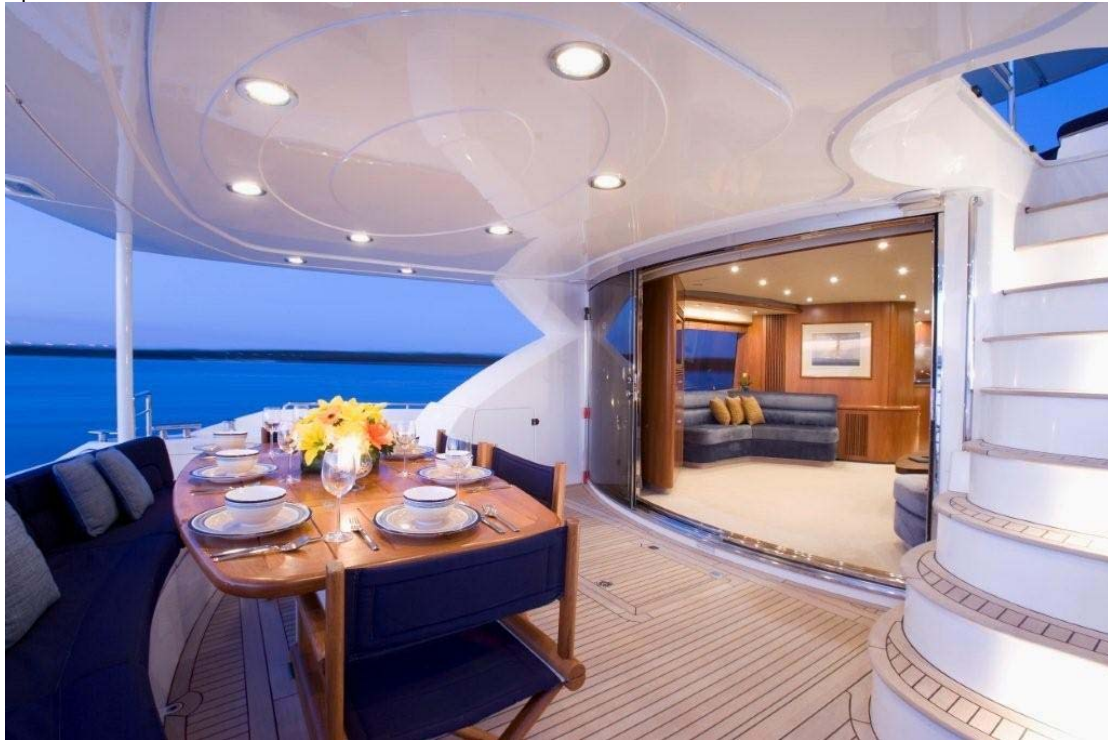
Alfresco Dining on the rear deck