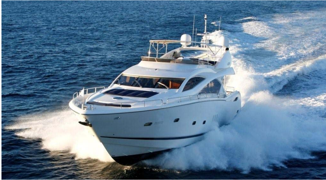
Speed and Grace are "Alani"