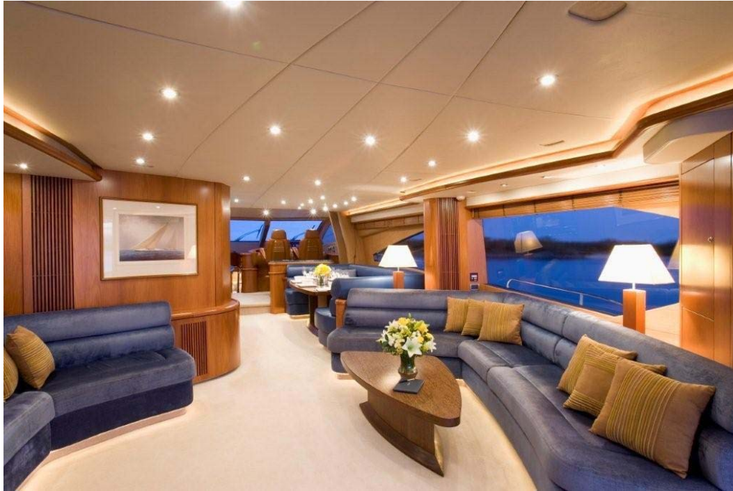
Full view of the lounge/ dining (galley located opposite the dining table)

Australian Charter Services PO Box 57, Berowra Heights NSW 2082 Tel: 0412 441 399 | Fax: 02 9456 4837 email: info@australiancharters.com.au www.australiancharters.com.au