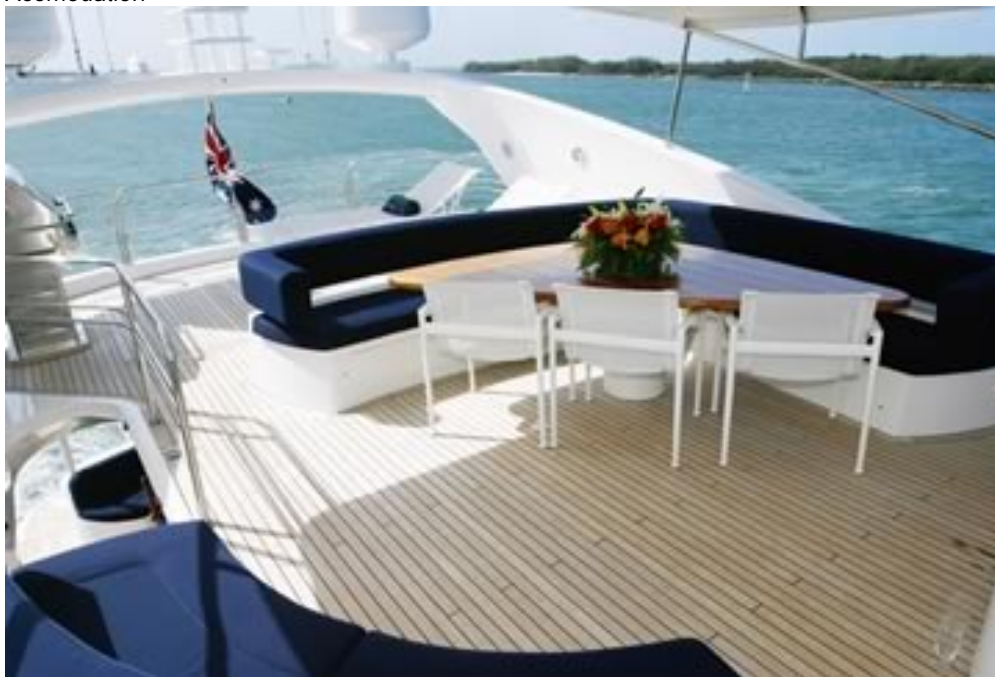
Upstairs open deck