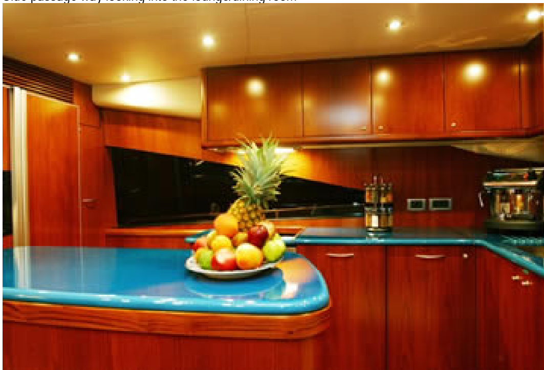
Galley. Located at the end of the lounge dining on the left hand side.